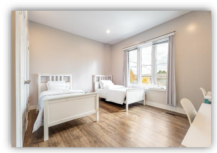
Bedroom - Shared