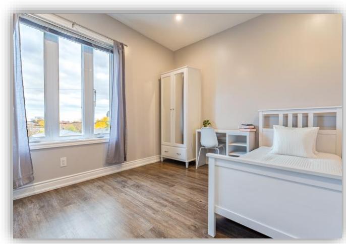
Bedroom - Single

Photos may not reflect facilities available in every unit.